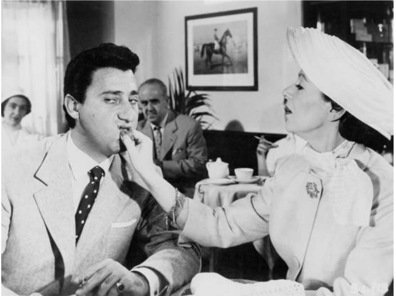
I ragazzi di via Panza (1951) Directed by Antonio Pietrangeli Music: Alberto Tomba (as Sergio)

Photos: good over time. EDITORIAL use only unless otherwise registered. Please inform us about usage or coverage in order as possible. Research fees may apply for images at need.