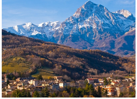
Mount Gran Sasso