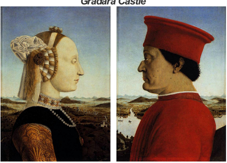
Federico da Montefeltro and Battista Sforza as portrayed by Piero della Francesca