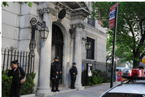
The Italian General Consulate in NY