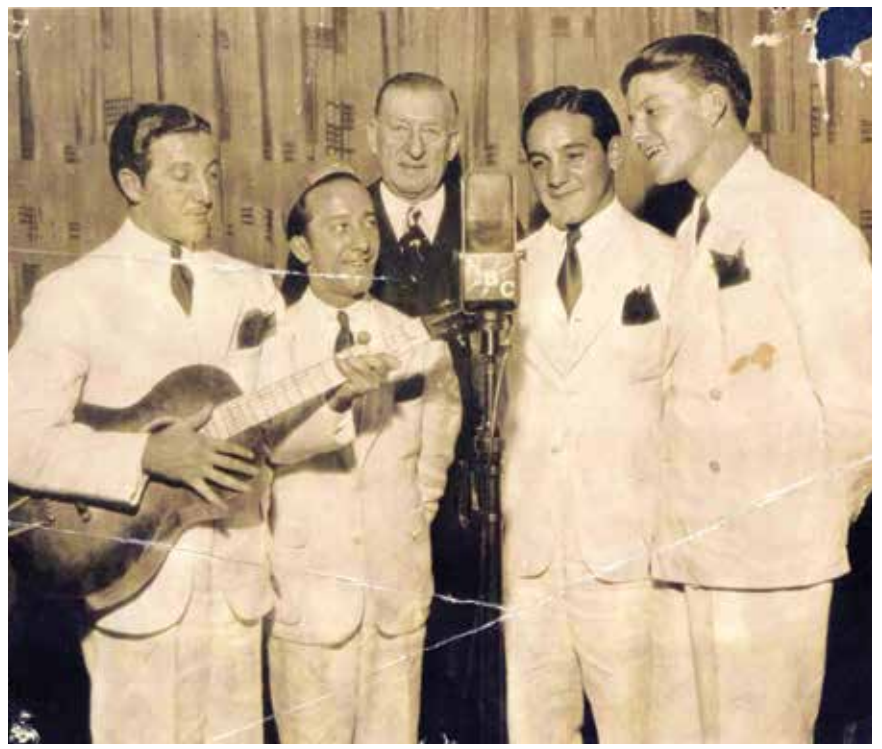
The Hoboken Four at a Major Bowes Amateur Hour radio broadcast, 1935 From the Collection of the Hoboken Historical Museum

The Helene Fortunoff Theater, Monroe Lecture Center, California Avenue, South Campus