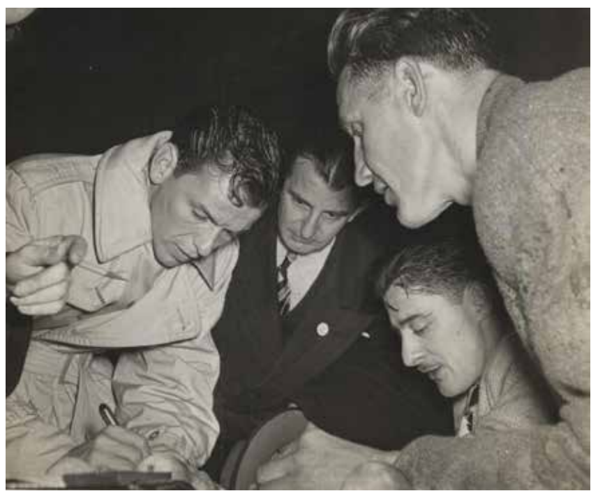
Frank Sinatra and fans at Hoboken City Hall, 1947

For more information, please call the Hofstra Cultural Center at 516-463-5669 or visit hofstra.edu/culture.